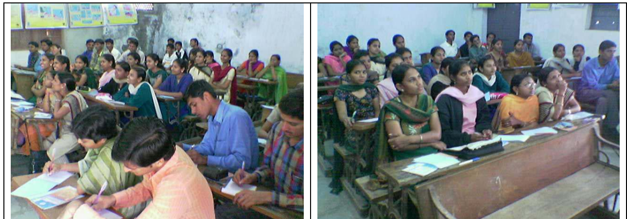
Active participation of NSS volunteers & WDMT members