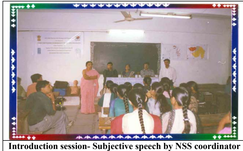
Introduction session- Subjective speech by NSS coordinator