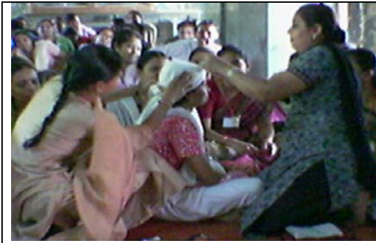
Practical Session-Naranpura ward