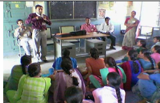
Practical Session – Juna wadaj ward